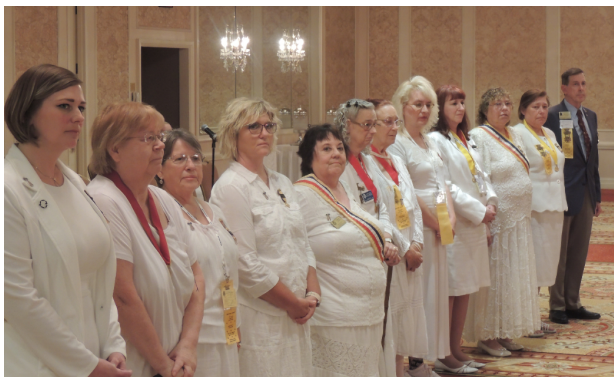
Installation of 2021-2022 National Officers