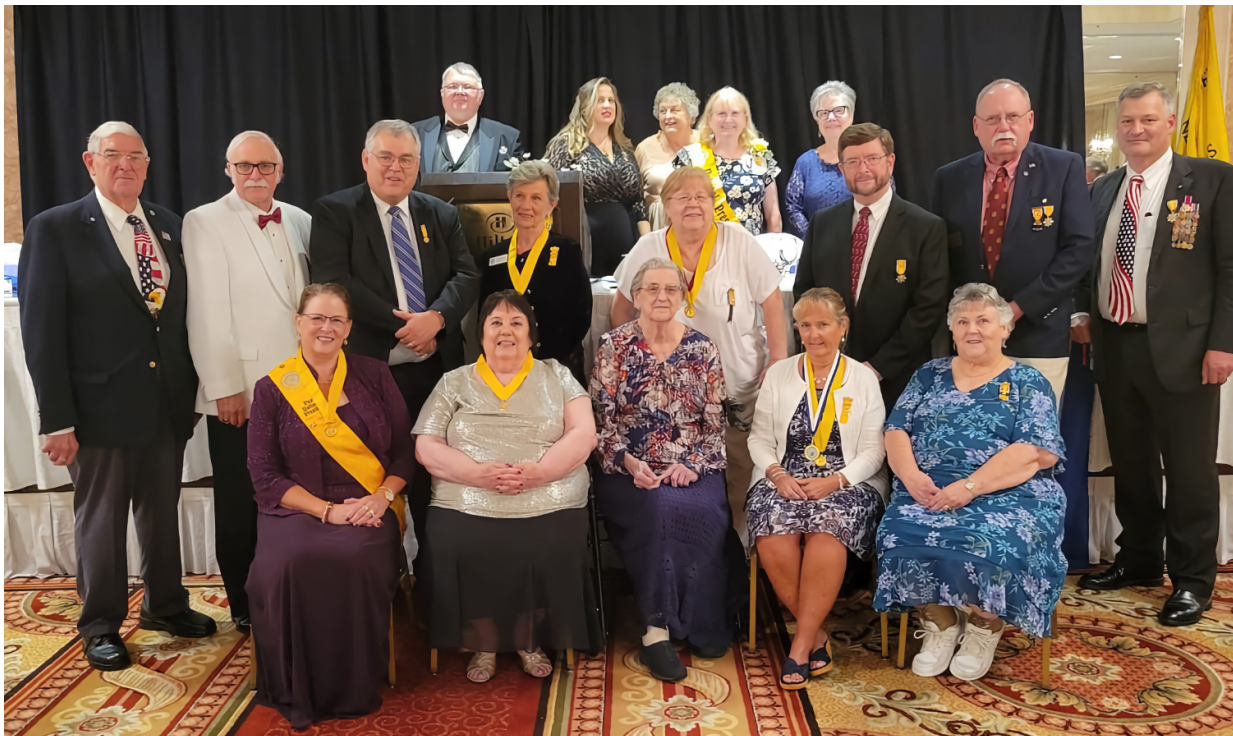
Past Commanders-in-Chief and Past National Presidents at the 2021 Encampment Banquet