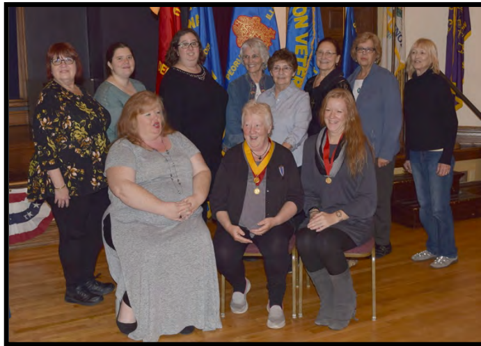
At left: Sisters of the Mary Logan Auxiliary No. 20 welcome members of the Mary Ann Bickerdyke Auxiliary No. 2, the state's newest Auxiliary.