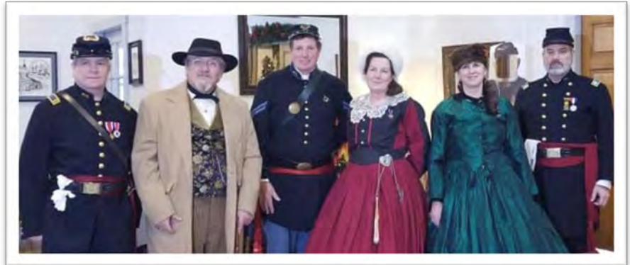
Revelers pose in Civil War-era garb at Department of the Chesapeake Civil War Christmas event.

EMMITSBURG, MD (December 16, 2018) – Twenty-five Sisters, Brothers and guests from across the Department of the Chesapeake came together on Sunday, December 16 to celebrate the holiday season. The event was held at the historic Carriage House Inn in Emmitsburg, MD, an antebellum structure dating from 1857 which saw thousands of Union troops pass its front door on their approach to Gettysburg in 1863.