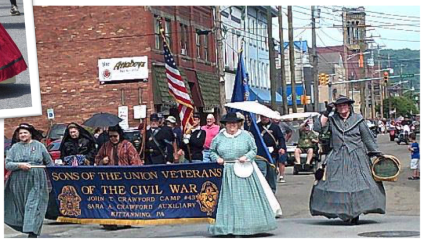
At right: Sisters of the Sarah A. Crawford Auxiliary No. 43 parading in Kittanning, Pennsylvania