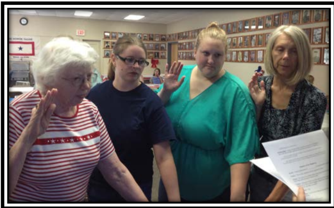
Above: The officers of the newly formed Sarah Emma Edmonds Auxiliary #32 are installed in Gridley, California.

The Auxiliary is named for Sarah Emma Edmonds (1841-1898) who disguised herself as a man and served in the 2nd Michigan Infantry. She was the only woman admitted to the G.A.R.