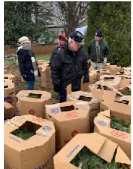
Wreaths arrive and must be unpacked.

All in all, it was a moving day! Moving in the sense that sisters, members of the local DAR, and others, were impressed by the sacrifice of those men and women who served and in some cases, gave the lives for their country. It was also moving as everyone was eager to move back inside to get out of the cold!