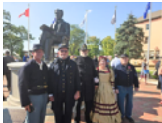
Department News 19-22