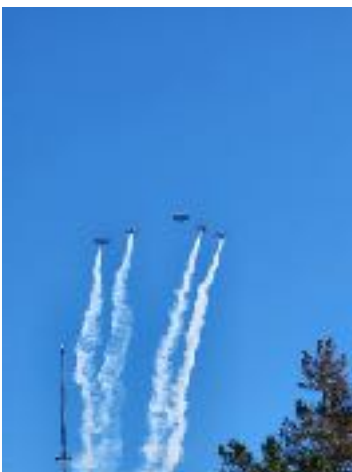
The program started with a flyover by five biplanes, four streaming smoke.