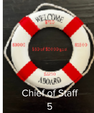
Chief of Staff 5