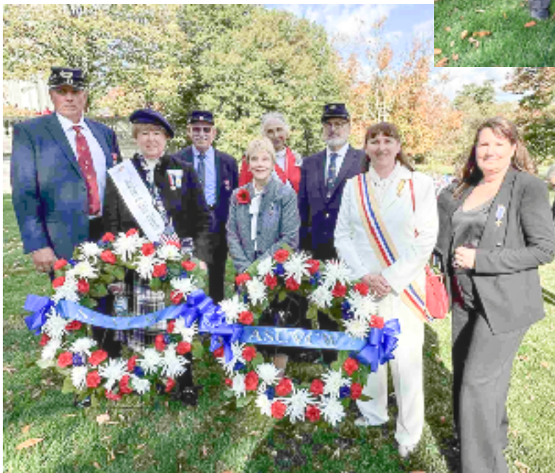
Allied Orders of the Grand Army of the Republic: Sons of Union Veterans of the Civil War (SUVCW), Daughters of Union Veterans of the Civil War 1861-1865, and Auxiliary to Sons of Union Veterans of the Civil War (ASUVCW) behind the SUVCW and ASUVCW wreaths