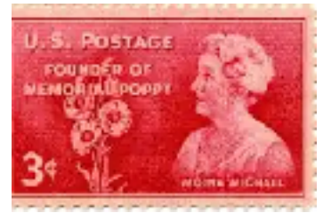
Patriotic Instructor 8-9