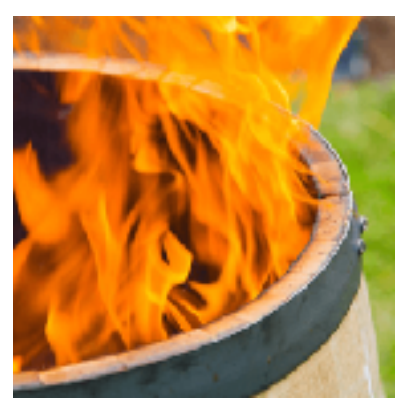
The Kentucky Bourbon Trail