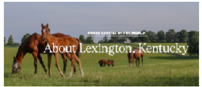
Lexington Visitors Bureau