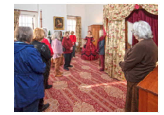
Waveland - 19th Century Kentucky Plantation