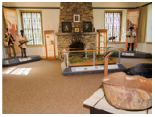
Blue Licks National Battlefield -Revolutionary War