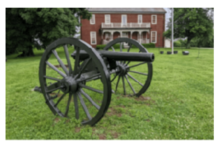
Battle of Richmond Visitors Center and Battlefield