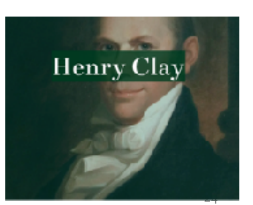
Ashland: The Henry Clay Estate