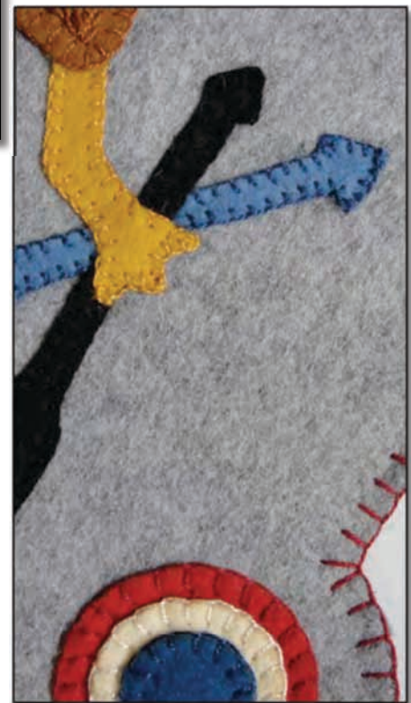
Detail showing quality hand stitching

• Additional tickets will be available at the Encampment!