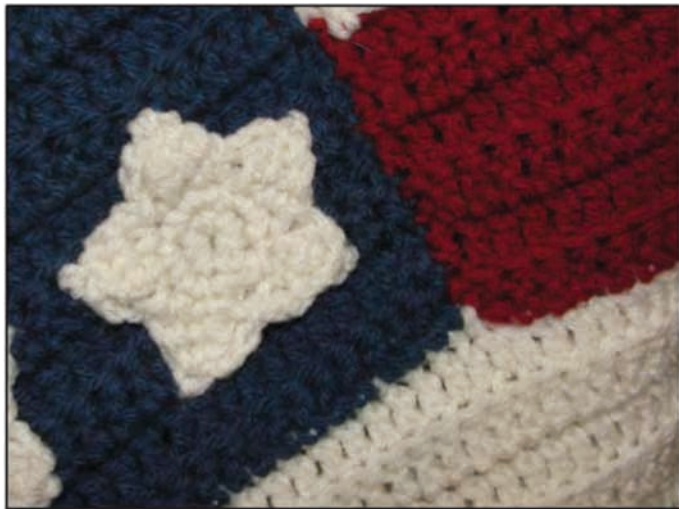
Detail showing the quality crochet work.

The drawing for the flag will take place during the 2012 National Encampment in Los Angeles on August 11th. One need not be present to win!