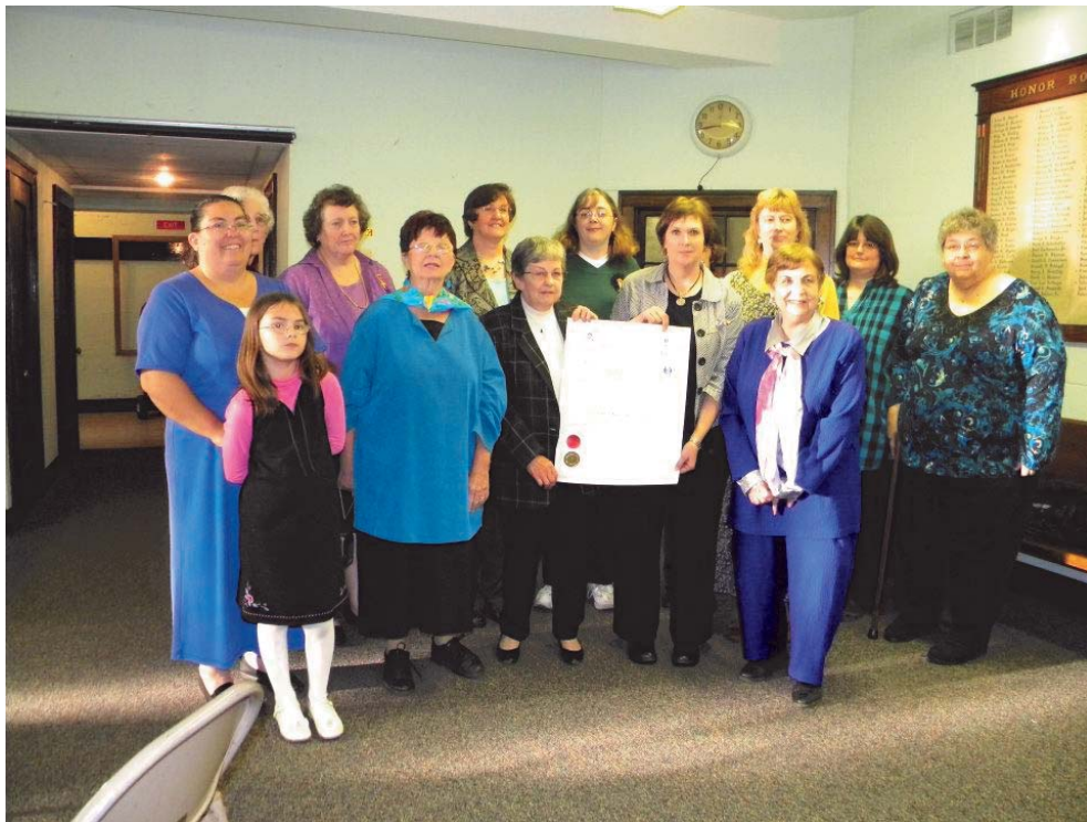
Chartering Ceremony for Auxiliary #503, Department of Pennsylvania Welcome Sisters!