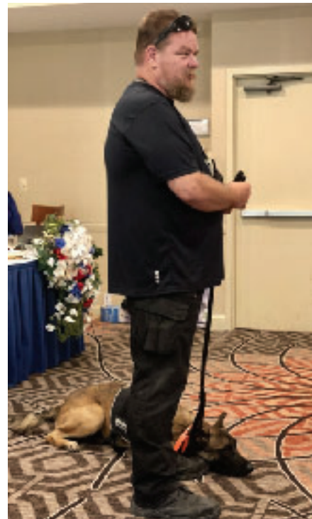
The Veteran Service Dogs Organization was selected by the National Patriotic Instructor to receive a donation. A representative from the organization explained the high demand of service dogs and training capabilities.