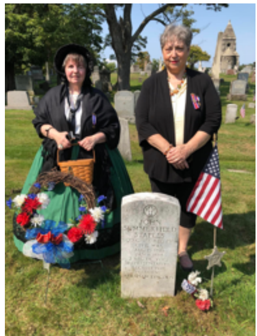
Keeping alive the Boys in Blue and perpetuating the memory of the services and sacrifices of the Union 8 Veterans of the Civil War

It was a wonderful day that we ended with a pasty picnic in Stroud Park and talked about the history of the civil war with members of other Camps and Auxiliaries.