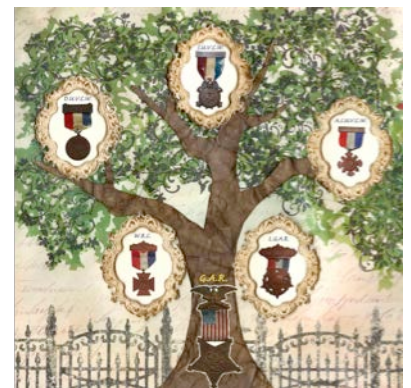
Allied Orders Family Tree