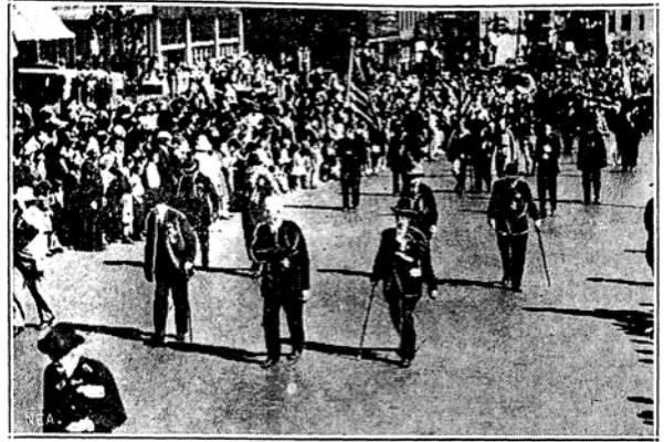
Union veterans march in St. Paul, Minn. during the 1933 Encampment